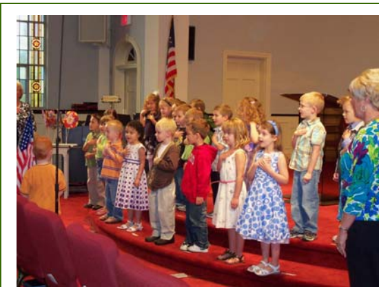
Saying the Pledge of Allegiance on Graduation Day!

The 3-Year-Old Class had a butterfly activity during Earth Week—learning about the changes that occur when a caterpillar forms a chrysalis to become a butterfly. There were four beautiful butterflies that were released into the air.