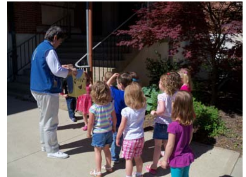
Releasing the butterflies was an exciting time for the kids!